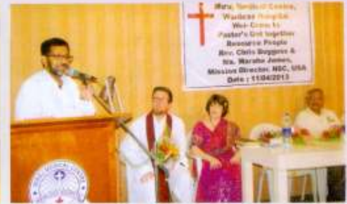
A meeting was arranged for the Pastors and Evangelists working in Southern Maharashtra, followed by dinner. 60 Pastors attended the meeting.